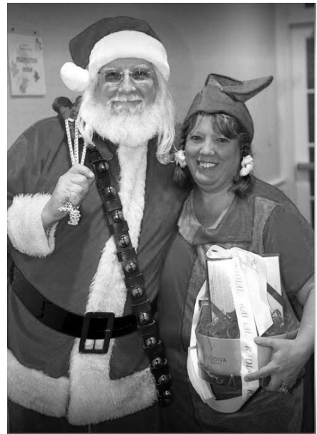
A surprise visit from Santa on 12/21